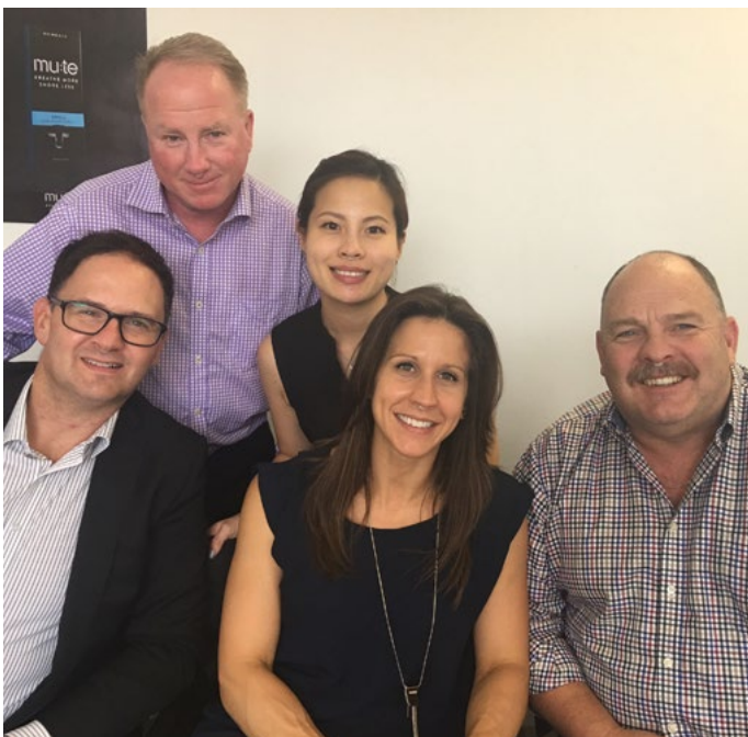
We “Muted” the BOC team!