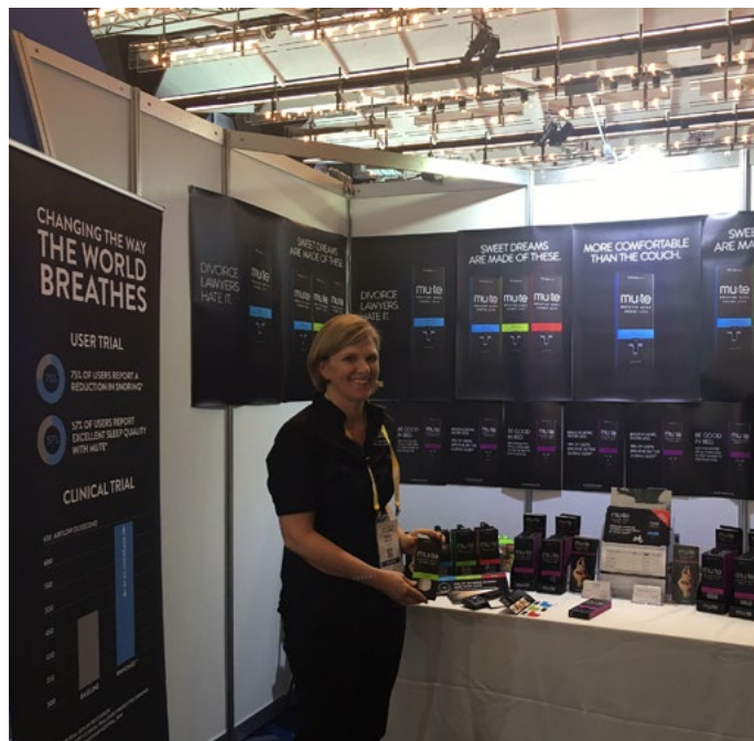
Mute showcased at Pharmacy Connect 2016