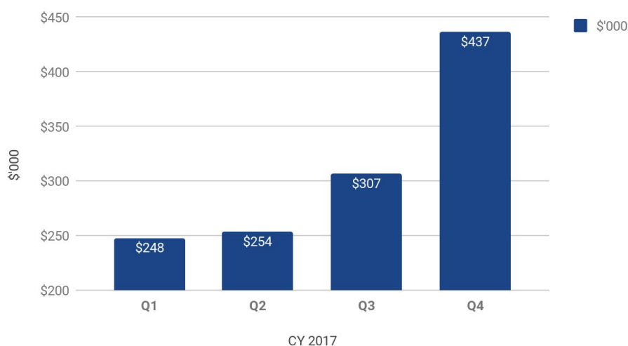
Calendar Year 2017- Recognised revenues

The net operating cash burn for the quarter was down 47% to ($754k) versus ($1.190 m) in the September 2017 quarter. This was in line with expectations and reflects the company's belief that investment in the growth of the Mute brand and the significant growth in the global store count will enable the business to reach CY18 company objectives. The closing cash balance at quarter end was $3.08 million. The company has a $2m working capital facility which was not utilized during the quarter. The company has no debt.